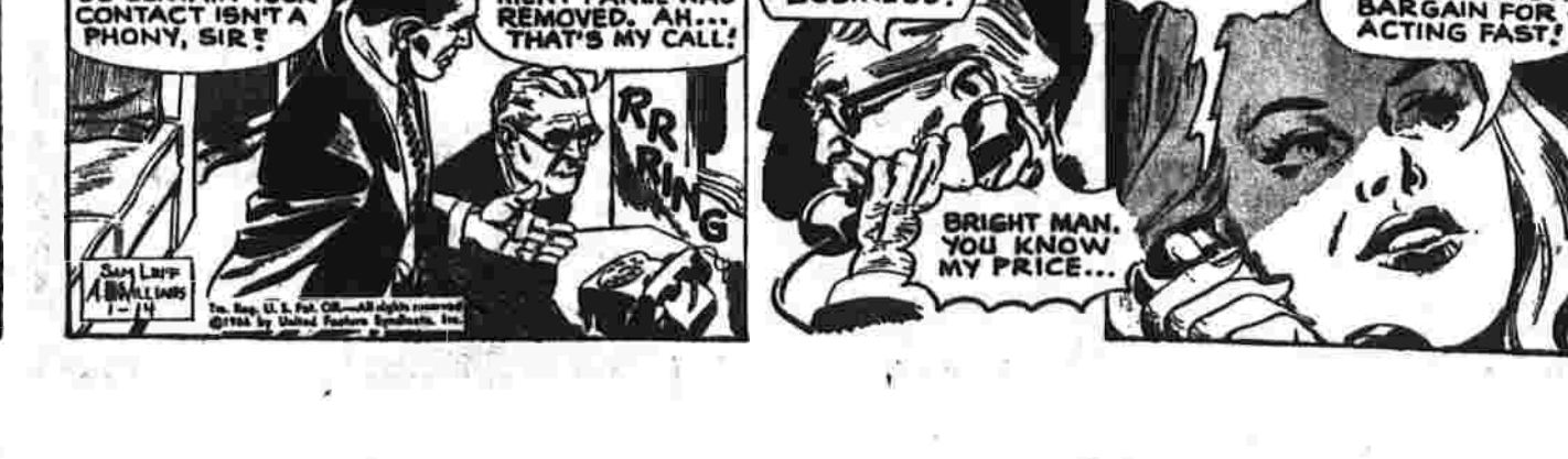
BY LEFF and McWILLIAMS