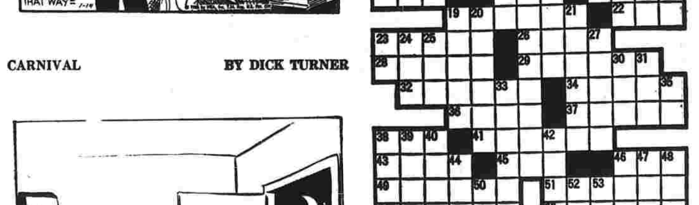
OUT OUR WAY