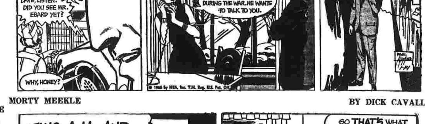
TWO A.M. AND ALL'S WELL-LL...